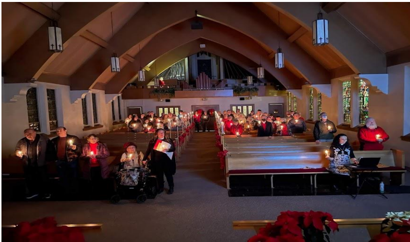
Christmas Eve Service December 24, 2021

Our Vision: We gather as believers who seek to grow in faith through worship, education and welcoming fellowship. We seek to share God's love with the community through word and deed. We extend Christ's love in service to our community and our world.